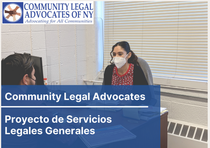
Community Legal Advocates Proyecto de Servicios Legales Generales