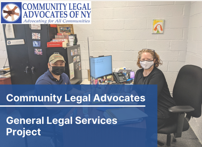
Community Legal Advocates General Legal Services Project